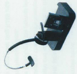
Jabra PRO™ 9400 Series