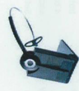
Jabra PRO™ 920