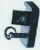
Jabra GO™ 6470