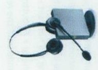
Jabra GN9120 EHS/ Jabra GN9125