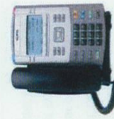
Nortel IP phone 1120E 1