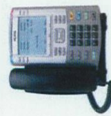
Nortel IP phone 1140E 1