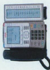
Nortel IP phone 1165E 1