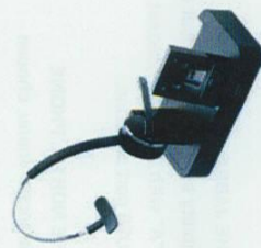
Jabra PRO™ 9400 Series