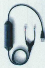
Jabra LINK™ 14201-32 EHS Adapter