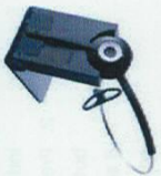
Jabra PRO™ 920