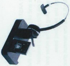
Jabra PRO™ 9400 Series