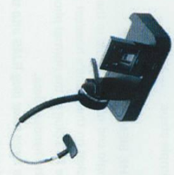
Jabra PRO™ 9400 Series