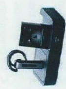
Jabra GO™ 6470