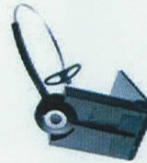
Jabra PRO™ 920