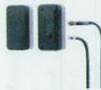
Jabra LINK™ 14201-20 EHS Adapter