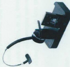
Jabra PRO™ 9400 Series